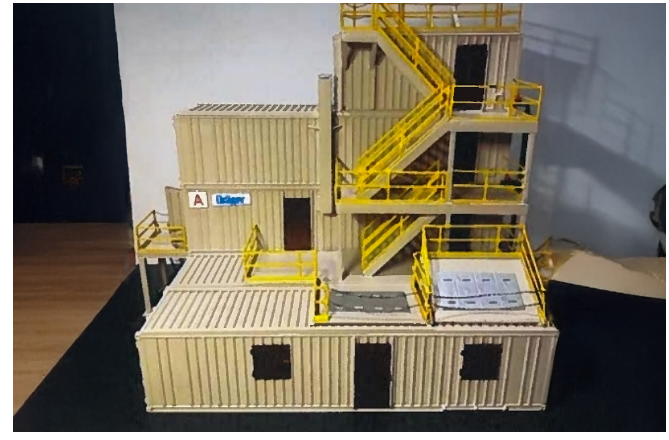
Pictured above is Mt. Lebanon's new training facility, now under construction. The training facility will be constructed of five 40-feet-by-10-feet-by-8-feet containers and one container half that size.